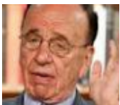
Warrior pirates: a media fantasy, created on by books. This is a caption