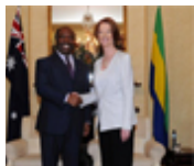
gabs on, imming up port for the dgy Bongo - this a caption

A decade on, it was discovered that while nobody's predictions had been particularly accurate, the garbos had done as well as the corporate chairmen and considerably better than the students or